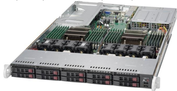
Figure 1: Supermicro 1U Ultra (SYS-1028U-E1CRTP+)

performance improvements are also comparable to the price improvements for equivalent performance.